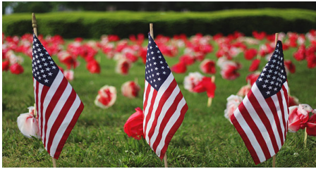
Memorial Day – May 31

Let Us Not Forget: Don't Let Memorial Day pass without a moment to remember our fallen heroes who gave the ultimate sacrifice for our freedom?